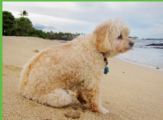
Bailey left a lasting legacy at the UC Davis veterinary hospital when his owners became loyal supporters of research in respiratory medicine.

Bailey was a 2-year-old apricot-colored ball of fluff when he first came to the UC Davis veterinary hospital in June 2002. While vacationing in Arizona, he contracted Valley Fever, a life-threatening fungal infection. Bailey was separated from his human and animal family throughout an intensive course of intravenous therapy. Halfway through his three-week hospitalization, he was finally stable enough for a visit with his owner and his favorite canine companion, Pippin. The outpouring of joy that I witnessed during their reunion is something I will never forget.