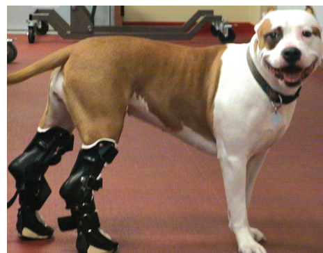
With the help of prosthetics, Roxie the pit bull now can walk, run and go up and down stairs.